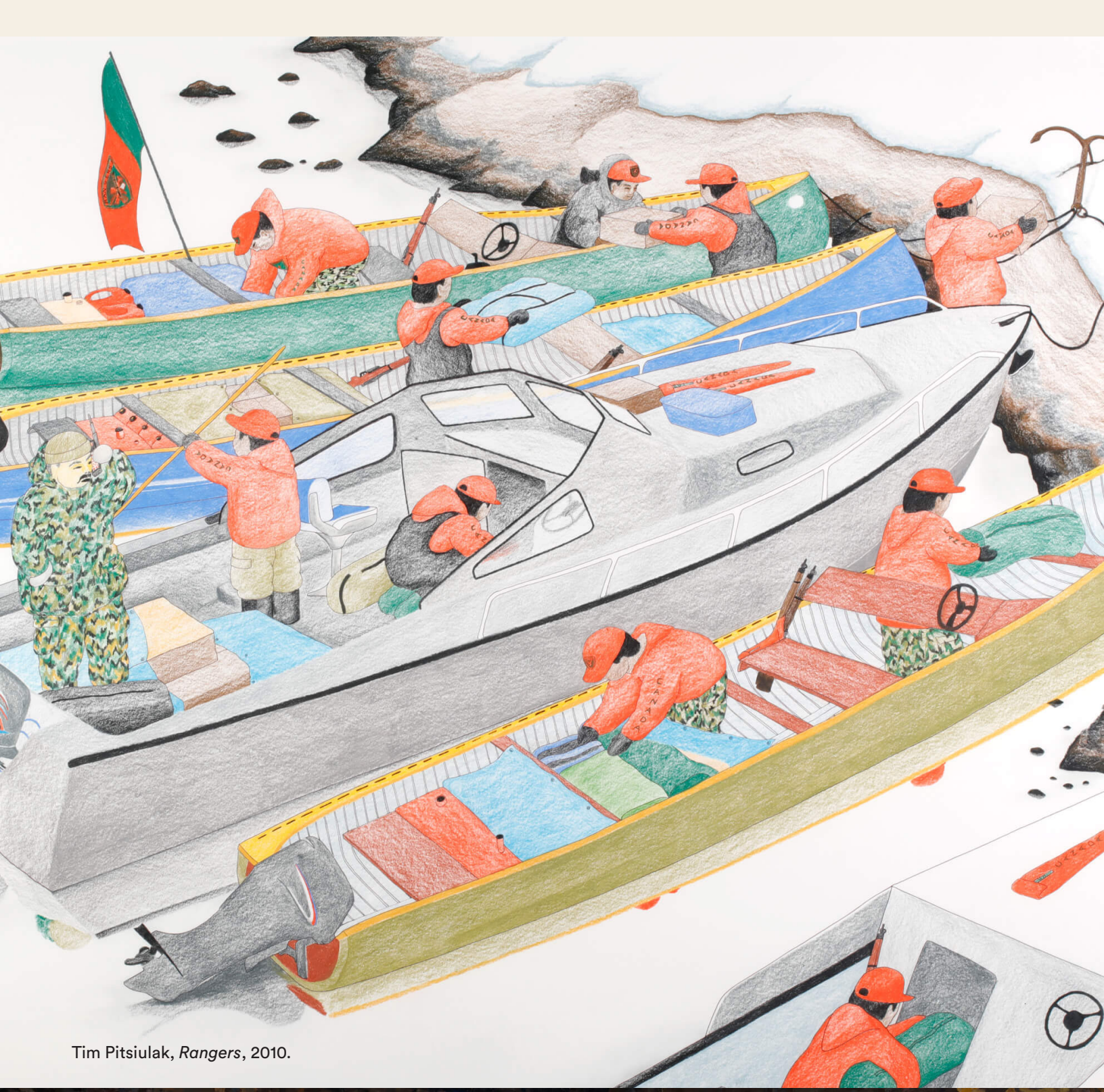
Tim Pitsiulak, Rangers , 2010.

MANY WAYS TO SERVE PLUS D'UNE FAÇON DE SERVIR